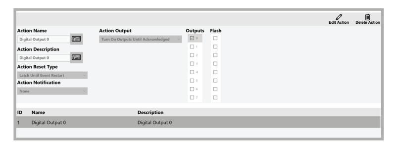
SET UP ACTIONS