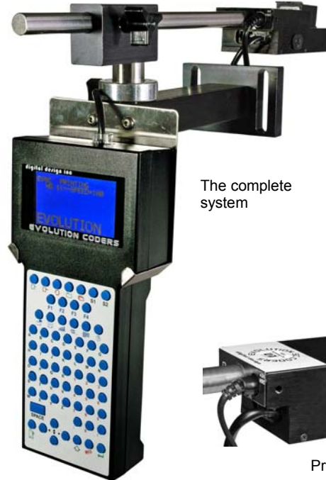
The complete system