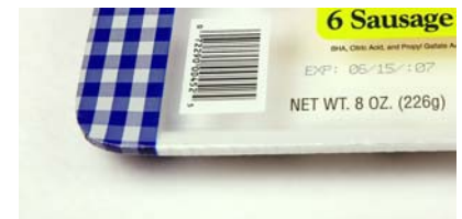
Actual printed samples with .125" character height.